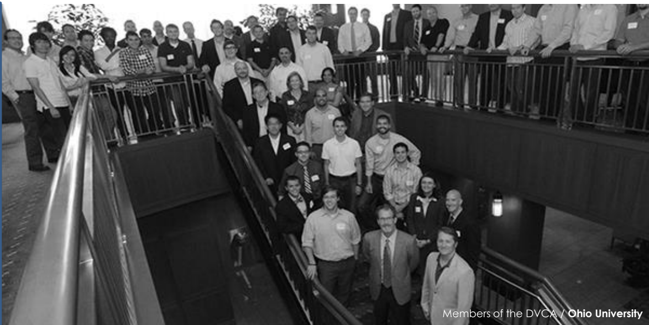
Members of the DVCA / Ohio University

Our Member List , include some of the most respected Veteran Venture Capitalists and Bankers as well as digital entrepreneurs and Industry Journalists, who have held executive positions in both start-ups and Large Corporations